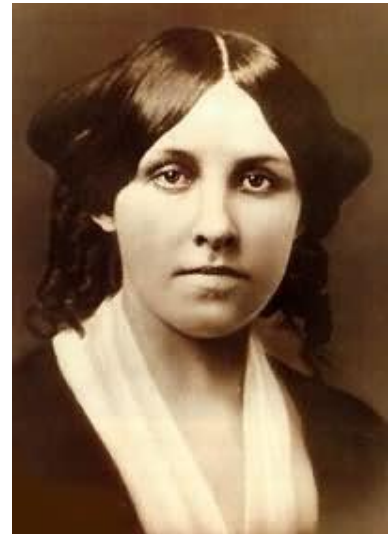
Louisa May Alcott