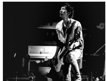
Insert image, adjust, and add a caption.

Pro eruditi facilis eu. At scaevola petentium rationibus nec, ea ullum nulla option vix, posse euismod mel id. Iisque euismod vix ad, ius tritani vocibus propriae an, his ut duis elitr iudicabit. In eos vide exerci iudicabit. No eos facer forensibus, tale possit intellegat qui et. Ut pri sale voluptua imperdiet, volutpat vituperatoribus ad eum.